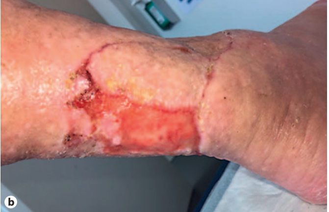
Fig. 2. A 90-year-old patient after excision of an ulcus hypertonicum Martorell and coverage with a split-skin mesh. a In due course, the formation of slightly bleeding, instable hypergranulations, which are possibly a sign of incipient infection. b After 2.5 weeks of daily dressing change and coverage with a Betadine gauze, the hypergranulations regressed and stable granulation tissue developed with a marked swelling of the wound vicinity.

The combination of PHMB/betaine was slightly less effective than NaOCl/HOCl against biofilm [132]. The speed of effect was superior to PVP-I, OCT, and PHMB [130, 133–137]. It can be assumed that the efficacy is reduced by protein or blood contamination, which can be reversed by repetitive extensive wound irrigation. The survival rate of rats with experimental peritonitis was significantly increased compared to a treatment with NaCl without undesirable effects [138]. By stabilization of the cell membrane, the release of cytokines from mast cells is