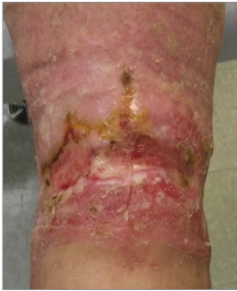
FIGURE 2 | Macerated periwound skin