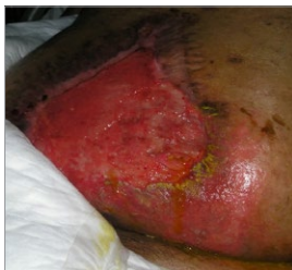
FIGURE 3 | Fistula and skin damage