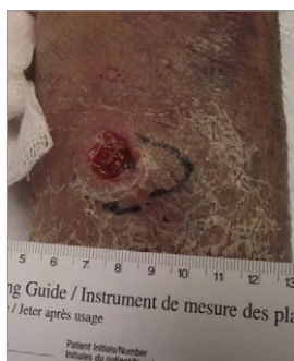
FIGURE 1 | Dry periwound skin

A wound is defined as a breakdown in the protective function of the skin and loss of continuity of epithelium, with or without loss of underlying connective tissue – i.e. muscle, bone, nerves (Leaper and Harding, 1998). A wound may be described in many ways; by its aetiology, anatomical location, whether it is acute or chronic, by its presenting symptoms or the tissue types present in the wound bed.