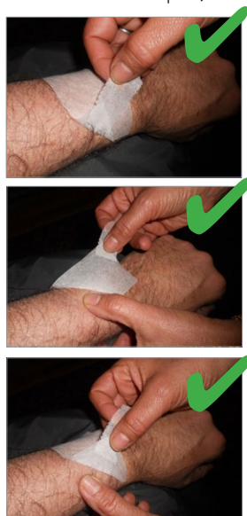
FIGURE 9 | Correct dressing removal technique