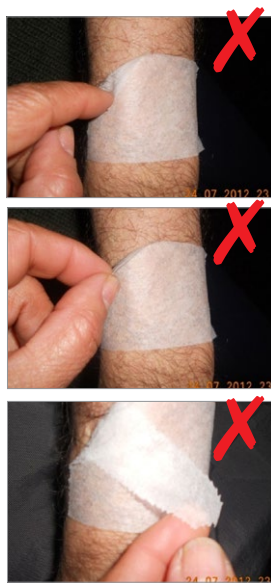
FIGURE 8 | Incorrect dressing removal technique