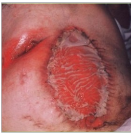
FIGURE 7 | Ileostomy