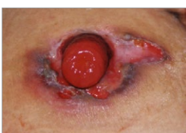
FIGURE 5 | Pyoderma gangrenosum

The skin surrounding a wound is particularly vulnerable and, although it may appear healthy, periwound complications frequently occur (Bianchi, 2012). According to Hunter et al (2013), the integrity of the periwound skin may be an important determinant in decreasing wound size. There are several wound-related factors that may result in periwound damage, such as exposure to exudate and the matrix metalloproteinases (MMPs) that exudate contains, infection, dressing adherence or allergic reactions (Bianchi, 2012). Types of periwound damage include maceration, denudement, excoriation, erosion, skin stripping and allergic reactions affecting the skin. Skin irritation can also lead to excoriation (Bianchi, 2012); pruritis (itch) can also occur, which may lead to further issues.