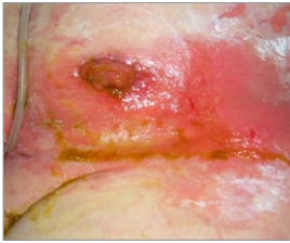
FIGURE 6 | Ileostomy