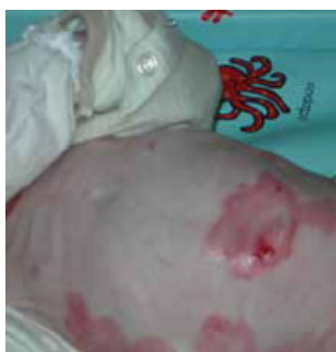
Figure 2: Patient aged 6 weeks after switching to a hydrogel impregnated gauze