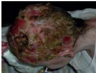
Figure 1: Wounds upon presentation