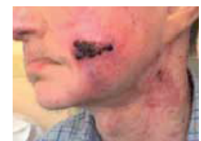
Figure 6: Skin loss following removal of soft silicone tape (without using SMAR)

The retaining bandage or tape can also lead to additional blistering from movement or contact with the surrounding skin. Retention must allow for freedom of movement to discourage development of contractures in those with DEB. A range of EB-specific retention garments, Skinnies WEB™ have been developed with the aid of patients and carers (Grocott, Blackwell et al, 2013) (Table 6, page 25).