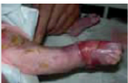
Figure 4 and 5: Patient at 48 days old using polymeric membrane dressings