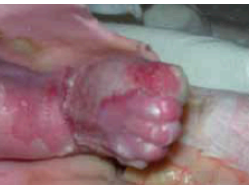
Figure 3: Patient at 28 days old after using polymeric membrane dressing