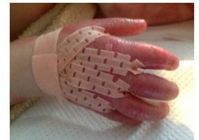
Figure 5: Using strips of dressing material (Spycra Protect) to preserve web spaces

Hand wrapping using a soft conforming 2.5cm bandage that provides downward pull on the web spaces and around the palm, is useful in preventing the loss of web spaces by forcing down the skin (Figures 3, 4 and 5). In some children extending this technique to wrapping each finger individually has been successful in maintaining good results after surgery. Any open wounds or blister sites should be covered with a non-adherent dressing before wrapping and intact skin should be protected with a layer of greasy emollient.