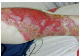
Figure 1: The patient's wound upon presentation

Initial improvement was apparent within 1 week using a lipido-colloid dressing in place of a soft silicone dressing. The wound bed appeared much less inflamed. The wound healed almost completely over a period of 18 months (Figure 2). A large contributory factor to the healing was undoubtedly the fact that the patient stopped work and spent time with his legs elevated and was able to carry out dressing changes more regularly. This, however, had a psychosocial cost and although the patient was very pleased with the healing achieved he became socially isolated and depressed.