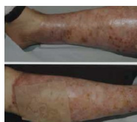
Figure 2: 18 months after change of dressing regimen and reduction in activity levels