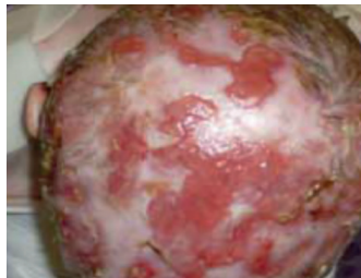
Figure 2: After four weeks of treatment with Flaminal Hydro