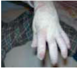
Figure 3: Full hand wrapping in a patient with RDEB-GS