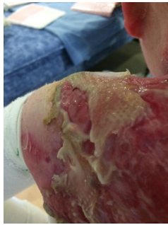
Figure 1: Pre-Melloxy treatment

Rapid cleansing and debridement of the wound was noted and healing progressed.