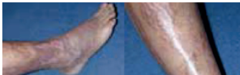
Figure 2: Patient 2 months after commencement of treatment using sheet hydrogel dressings