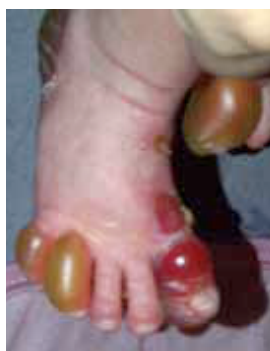
Figure 1. Blisters on toes in patient with EBS