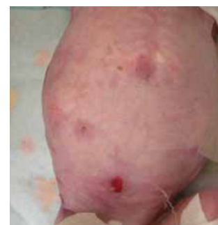
Figure 3: Aged 13 months following treatment with a lipido-colloid as a wound contact layer with a hydrogel impregnated gauze as a secondary dressing