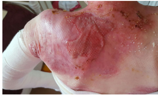
Figure 2: 8 weeks post Melloxy treatment