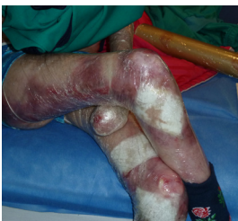
Figure 11: Clingfilm is applied directly to intact skin and open wounds