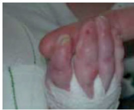
Figure 4: Modified hand wrapping to allow greater freedom of fingers (to be used in infants/toddlers for messy play and finger feeding). May be preferred by older children and adults