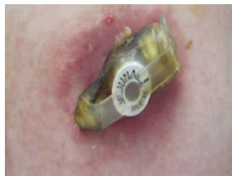
Figure 2: After 1 month of using super-absorbent drainage dressings