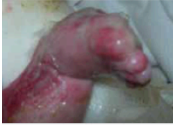
Figure 1: Patient at 18 days old. Soft silicone mesh and foam dressings were used to treat wounds