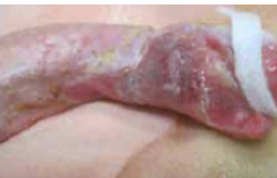
Figure 2: Strips of Hydrofiber are placed between the toes (all toes except the great toe fused in this infant).