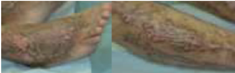
Figure 1: Patient before the application of hydrogel sheet dressings

(Taken from a poster presentation: Pillay E. The use of a hydrogel sheet dressing in the management of pruritus and scarring. 2010; Wounds UK, Harrogate)