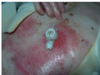
Figure 1: Gastrostomy wound before being treated with super-absorbent drainage dressings

Leakage continued but was contained with the super-absorbent dressings. Clothing remained dry, which was important to the patient. Over the course of 6 weeks the wound decreased in size to a 1cm x 1.5cm area beneath the gastrostomy button and the large area of excoriation healed (Figure 2). Pain scoring on the Wong Baker Scale dropped from 10 to 2 during both dressing changes and wear time.