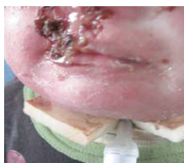
Figure 7: When using a tracheostomy tube in small infants an extension tube may be needed to prevent it rubbing under the chin

Some children and adults with DEB develop delayed gastric emptying, which encourages leakage from the site. In severe cases gastrostomy feeding is not tolerated and jejunal feeding may be necessary. The gastrostomy is replaced with a gastro-jejunal or naso-jejunal device. Although jejunal feeding allows adequate delivery of nutrition, the gastrostomy will continue to leak gastric contents.